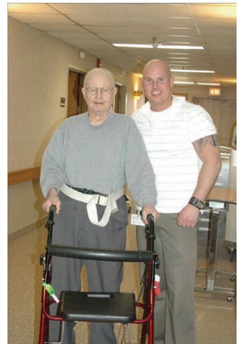
Physical Therapy in the Corridor