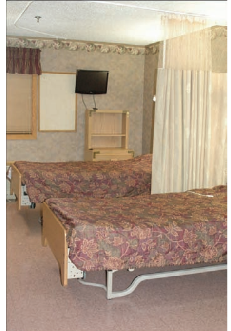
Semi-Private Room: Short Term Unit