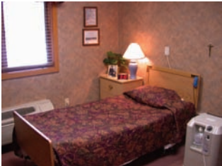
Pictured is one of our private rooms on the Plum unit.

Columbus West Park is pleased to announce that the room renovations on our Plum Unit were completed in April. The renovations included new wallpaper and border, new sinks, and new lighting.